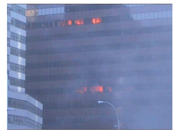
(Fig. 8) Detail of fig.7. Small fires smolder on floors 7 and 12.

plummeting debris impacted the electrical substation and diesel tanks located throughout Building 7—causing massive internal explosions that kicked its feet out from under it—would have made good sense to most observers (in the absence of visual evidence to the contrary) and done much to provide satisfactory "cover" for the real cause of the building's destruction: preplanted explosives. In the end, Building 7's suspicious collapse would become just an afterthought in the minds of a stunned public. Few would have given another thought to the demise of this, the last of seven WTC buildings to be completely destroyed by "Islamic extremists" on September 11.<sup>th</sup>