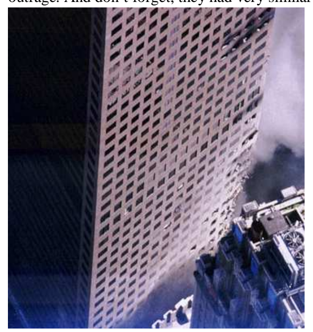
(Fig. 10) The damage sustained by WTC 7's southeast corner. The Verizon Building's roof can be seen in the lower right-hand corner.

What a mistake to think of the 9/11 conspirators as criminal masterminds. Imagine their state of mind as they watched their plan to destroy one of the world's most famous landmarks (and, of course, violently murder thousands of innocent people) unfold before their eyes. Even the most jaded covert operative wouldn't likely remain un-rattled after having perpetrated such an outrage. And don't forget, they had very similar performance problems in OK City. Certainly we