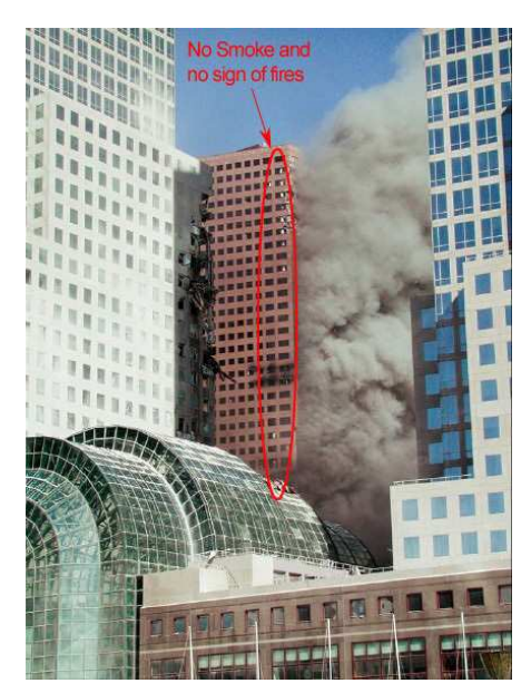
(Fig. 14) Was the smoke pouring out of WTC 7 the result of debris damage from the North Tower's "collapse" or an explosion from within Building 7?

The only explanation that's ever been offered by anyone in Silverstein's defense is that he used the word 'pull' to indicate instead the cautious evacuation of WTC 7's perimeter in the event of another unprecedented collapse. But I believe that this usage of 'pull' is just as damning, and this is why: For these guys to 'pull,' (clear the area around) Building 7 and then have it fall right on cue, when physics doesn't support the phenomenon, the building was, at best, only marginally involved and no steel-framed building has ever collapsed because of fire (except on 9/11 when it happened three times) is all simply too much of an implausibility to take seriously. Also, officials involved in the FEMA and NIST investigations into the odd collapse of WTC 7 specifically stated that "there was no fire fighting in WTC 7" to begin with. Under the circumstances, the ruse that Silverstein used the word 'pull' to mean evacuation, not demolition, just ends up looking like spin, pasted into place after his crude "hang-out" attempt on prime-time TV backfired and created more suspicion than it dispelled. This, and several other compelling points, wholly tie Silverstein into the suspicious events of the day at the highest levels and