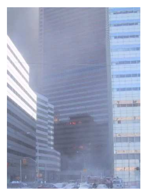
(Fig.7) WTC 7's tiny fires photographed at approximately 3 PM.

Once the conspirators had safely repositioned themselves, they again awaited the optimum moment to proceed. When they were ready, the plotters initiated the second demolition sequence by pushing the button on what had just become the safely distant North Tower, its catastrophic collapse a carbon copy of the South Tower's complete and symmetrical plunge to earth. As the North Tower fell, a massive cloud of debris shot into the sky, quickly rising to almost twice the height of WTC 7 (figs. 4-6) and smothering lower Manhattan. Then, a minute or two later, when Building 7 was completely hidden from view and the world's attention was distracted by the unthinkable destruction of the Twin Towers, the conspirators triggered WTC 7's explosive system as well. As it fell, the thick cloud of debris enshrouding it would completely conceal any signs that Building 7 was being intentionally demolished.