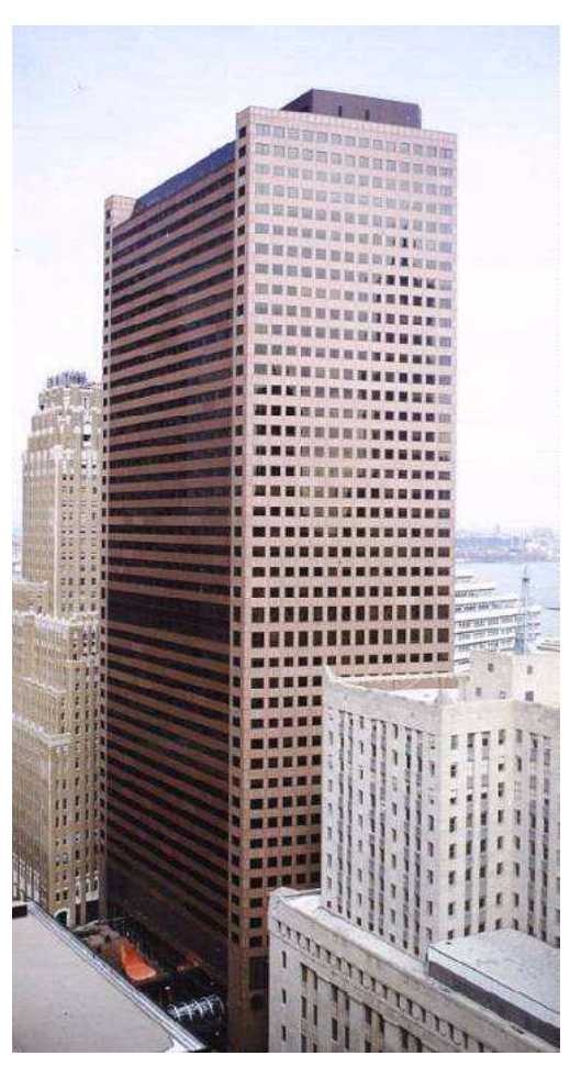
(Fig. 1) The enormous, 47 storey World Trade Center Building 7. The Verizon Building stands at left, the U.S Post Office Building at right.

If I were a gambling man I'd bet the farm. The 9/11 conspirator's original attempt to demolish World Trade Center Building 7 came shortly after the collapse of the North Tower, when WTC 7 was completely hidden under a thick cloud of debris—and the attempt was a complete failure. Whether through sabotage or malfunction, the pre-installed demolition system in Building 7 just didn't operate as planned and what was to be the swift conclusion of an elaborate plot to completely destroy the entire WTC—and, of course, provoke war with the Islamic states—proved instead to be a blunder of epic proportions.