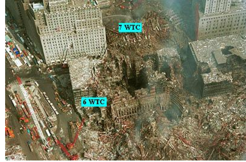
(Fig. 13) Another aerial view of the Verizon Building and the remains of WTC 6 and WTC 7.

documentary may not be as hard as it seems. Using Karl Rovelike sleight of hand, Silverstein's well-oiled comments offer us a vague accounting of the anomaly delivered to us on an almost subconscious level. However subtle this attempt may have been, his simple and concise phrasing—that "...they made that decision to 'pull' and we watched the building collapse" —has impressed many of the finest 9/11 researchers as being clear and unambiguous, and for good reason.