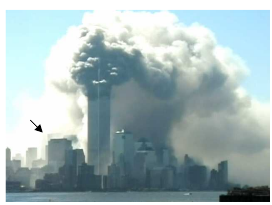
(Fig. 4) WTC 7 (arrow.)

First, the 9/11 conspirators—possibly operating out of Mayor Giuliani's Office of Emergency Management (OEM); a reinforced, self-contained emergency command retreat built on the 23<sup>rd</sup> floor of WTC 7 in 1999—orchestrated the collision of two Boeing passenger jets into the World Trade Center Towers. The dramatic impacts caused fires that spread throughout the upper floors of both towers and allegedly resulted in significant structural damage to the buildings' core columns (both would later be used to explain the buildings' unprecedented collapses).