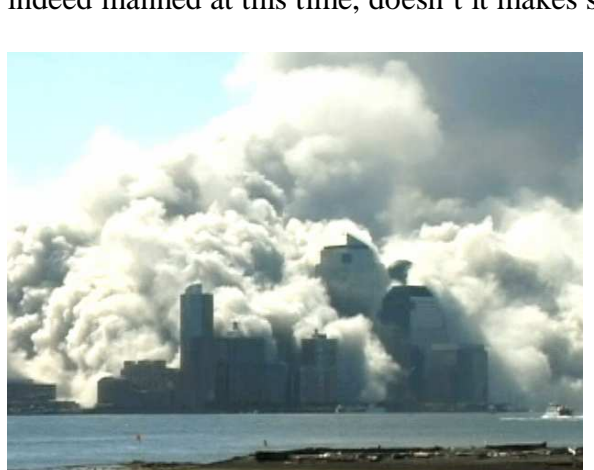
(Fig. 6) The North Tower's debris cloud rises to almost twice the height of WTC 7.

Some researchers have speculated that the conspirators demolished the South Tower first because the smoldering fires burning in its upper floors had begun to go out and any further delay in its destruction would make the fire-caused-the-collapse scenario appear less and less plausible. But this theory has always been just that, speculation, and certainly leaves room for other possibilities. And if the OEM bunker was indeed manned at this time, doesn't it makes sense