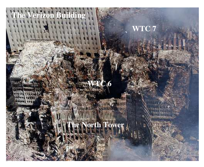
(Fig. 12) The south face of the Verizon Building stands in near pristine condition at upper left. The lack of damage to its façade seems inconsistent with the heavy damage officials claim had impacted Building 7 (right).

The debris-caused-catastrophic-damage-and-fires-to-WTC 7 theory would appear to make sense were it not for the strange lack of damage to a building right next door that logically should have sustained similar damage. Photos of the Verizon Building (standing just across a side street to the west of WTC 7) clearly show that it sustained, at best, only light damage. Despite suffering one or two minor puncture wounds, presumably from stray girders, the building remained virtually unscathed by the debris that had apparently "scooped out" a quarter of WTC 7's total depth. Site plans (fig.11) of the area confirm that debris from the collapsing North Tower should have impacted both buildings equally. But look at these aerial photos of the Verizon Building's south face (figs. 12 and 13), especially its sharp southeast corner (directly opposite WTC 7's heavily damaged south west corner); it stands in near pristine condition—not a nick or a scratch on it. What force could so heavily impact WTC 7 and yet leave the adjacent Verizon Building virtually untouched? Some might argue that the buildings were constructed of different materials, but one would think that any wreckage that allegedly caused such profound damage to WTC 7 would surely have left its mark on its cozy neighbor, no