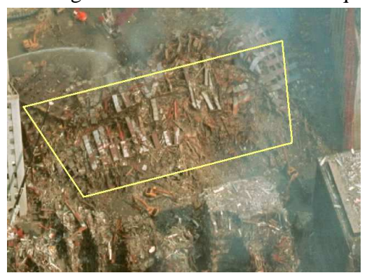
(Fig. 2) The wreckage of WTC 7.

The dramatic and well planned flights of the jets into the Twin Towers, the ensuing structural damage and fires was, to most observers, convincing "cover" for what is commonly believed to be the real cause of these buildings' destruction—pre-planted explosives (To some, this ploy may sound familiar. The very same scheme was played out in Oklahoma City when Timothy McVeigh's crude fertilizer bomb provided "cover" for the explosive system planted within the Alfred P. Murrah Building, a fact confirmed by myriad reports that two of the bombs in the building were found intact and subsequently disarmed). But what happened to WTC 7? Even as