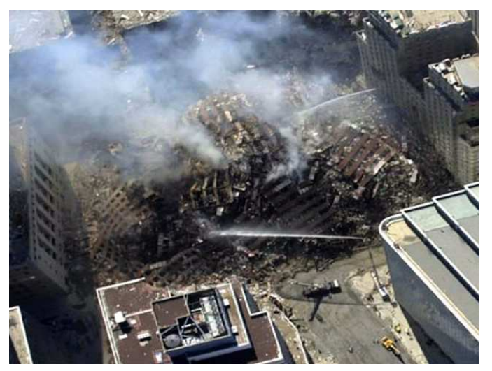
(Fig. 3) Another view of WTC 7's wreckage looking south. The Verizon Building stands at right.

Besides this plan's general lunacy, a compelling array of evidence points instead to its likely alternative—that the 9/11 conspirators originally intended to demolish WTC 7 earlier in the day; probably when it was being upstaged by the dramatic collapses of the Twin Towers and was completely hidden from view under a thick cloud of debris. We could nick-name this phenomenon the "Marriot Vista Hotel" effect after the 33 story building that once stood between the Twin Towers. One of seven WTC complex buildings, it was completely destroyed when the towers collapsed, and then, for all intents and purposes, vanished into obscurity.